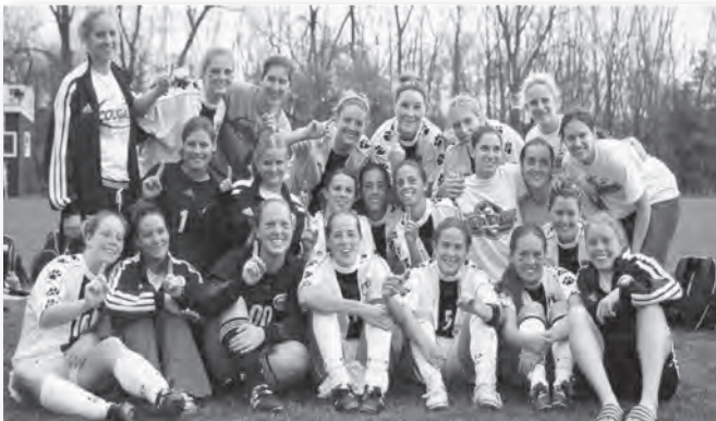
2003 Team – AMC South Division Champions (20-3-1)