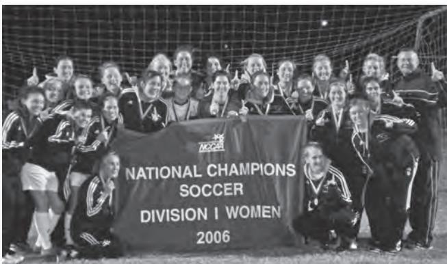
2006 Team – NCCAA National Champions (13-7-2)