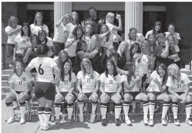
2011 MVNU Women's Soccer Team