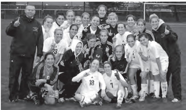
2007 Team – AMC South Division Champions (15-7-1)