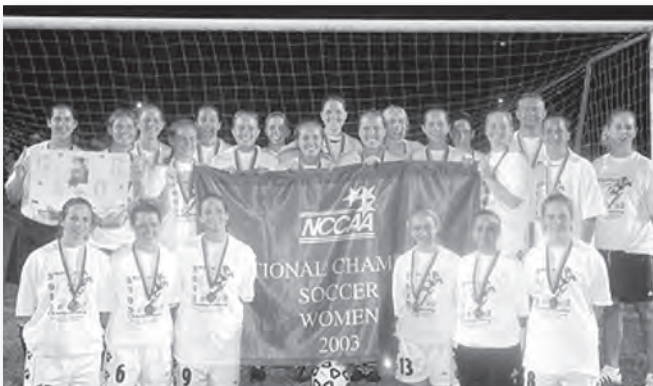
2003 Team – NCCAA National Champions (20-3-1)