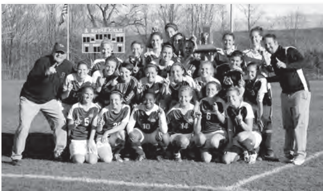
2009 Team – AMC Tournament Champions (11-6-2)