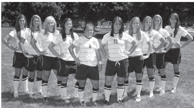
2011 MVNU Women's Soccer Seniors