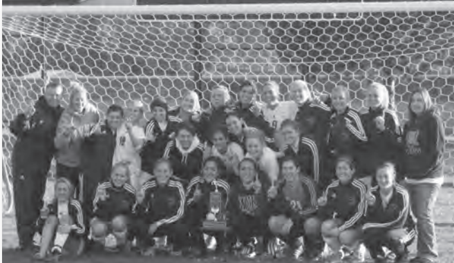
2006 Team – AMC South Division Champions (13-7-2)