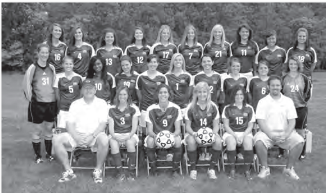
2009 Team – NAIA National Tournament Qualifiers (11-6-2)