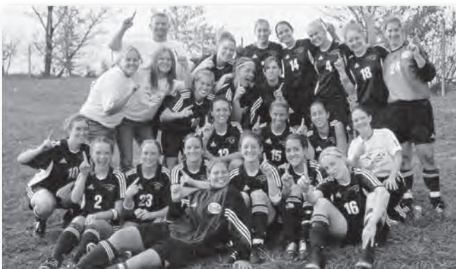
2004 Team – AMC South Division Champions (19-5)