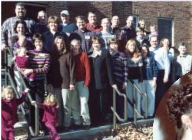
Above: Class of '96 reunion.