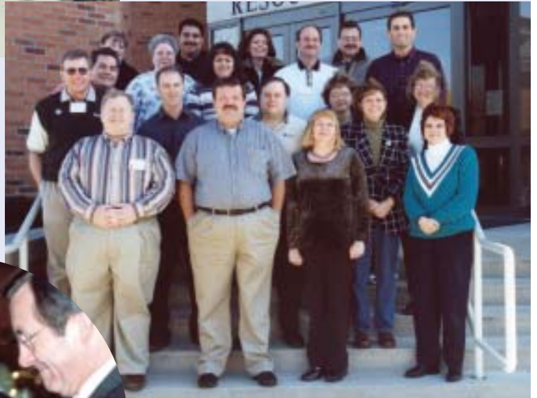
Above: Class of '86 reunion.