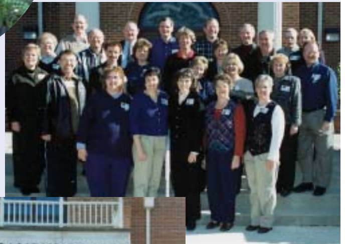
Left: Class of '76 reunion.