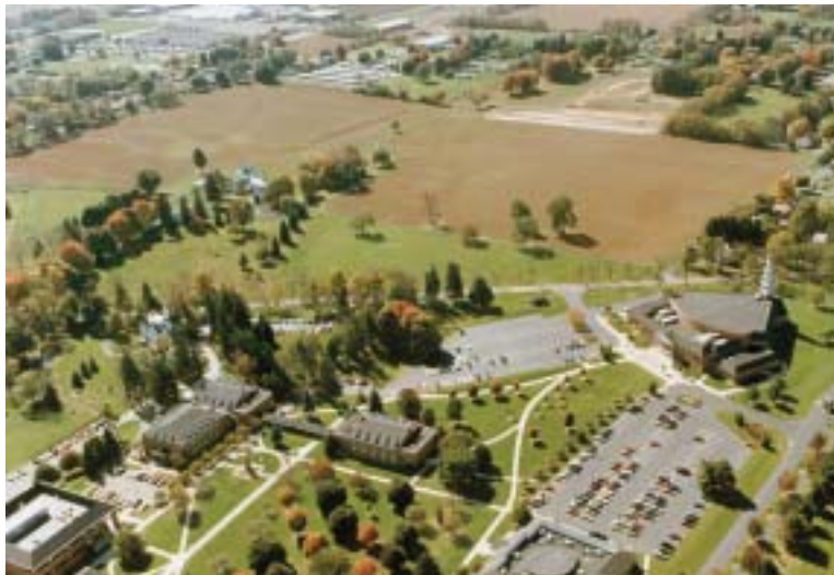
MVNC looks forward to utilizing the new land across from the College as we continue to grow as a University.