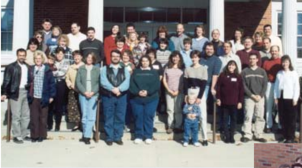
Above: Class of '91 reunion.